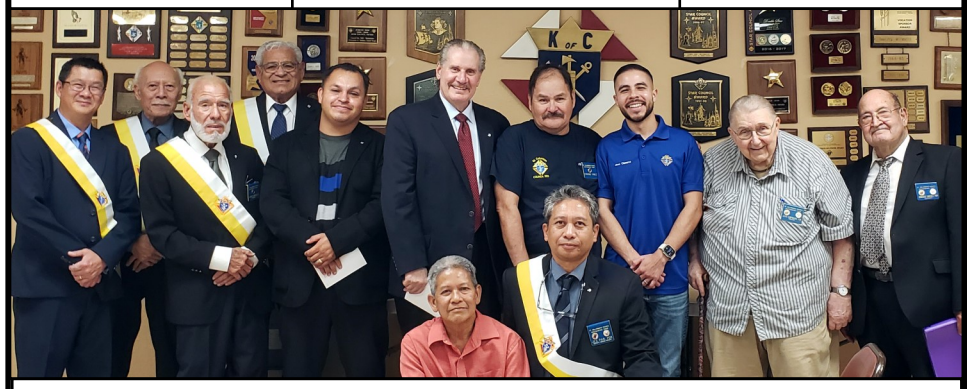
KoC Council 3926 Leadership and Exemplification Team with our Worthy New Knights