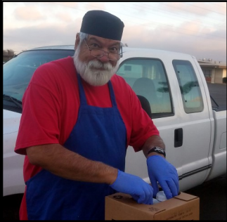
Preparing to cook/fray at the annual KofC Lenten Fish Fry